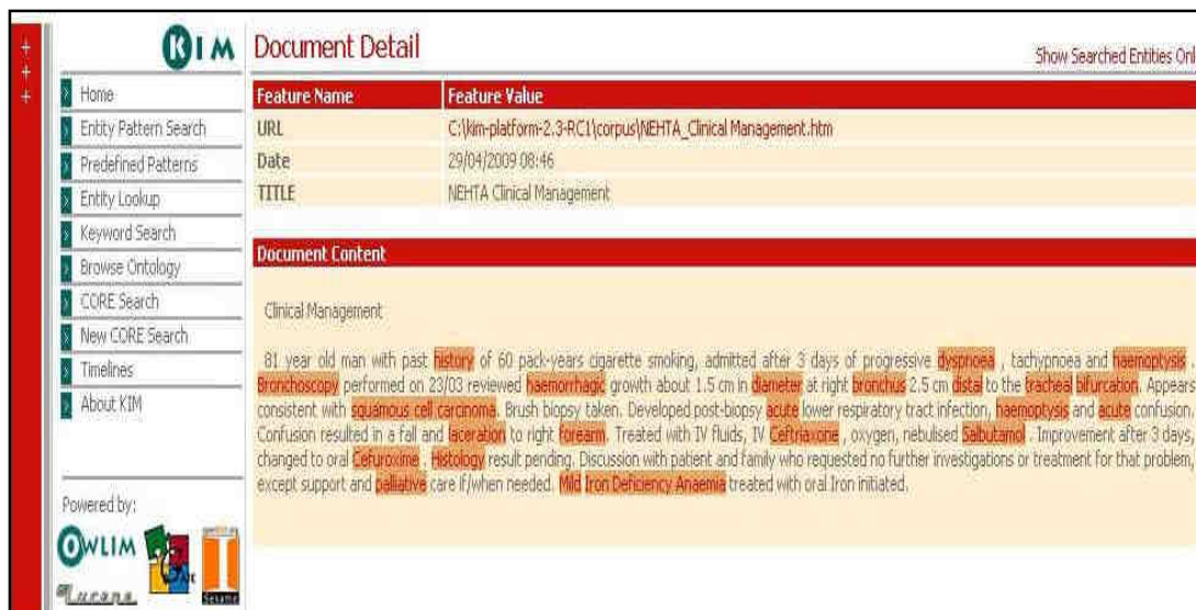
Figure 1 - Screen Shot of an Annotated Clinical Management Section in the KIM Web UI