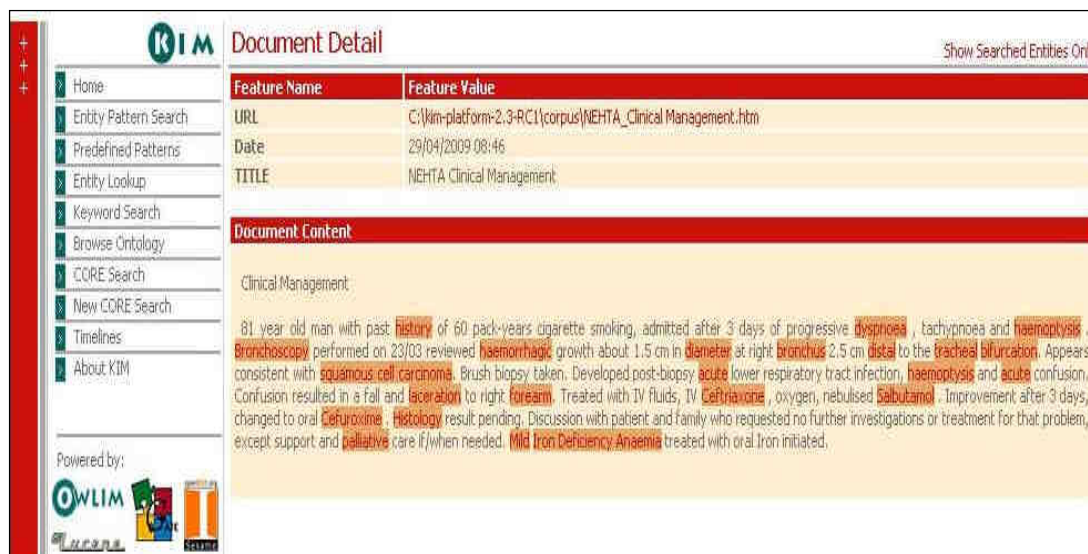
Figure 1 - Screen Shot of an Annotated Clinical Management Section in the KIM Web UI